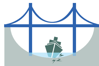
Or water level is below a certain level